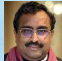
Shri Ram Madhav Member, National Executive, Rashtriya Swayamsewak Sangh and Member, Board of Governors, India Foundation, India