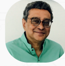
Shri Swapan Dasgupta

India's Sherpa to G20, Former Union Minister