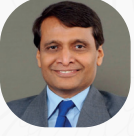
Shri Suresh Prabhu

National Vice President and Spokesperson, BJP