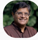
Shri Baijayant Jay Panda

Chairman, 15th Finance Commission of India