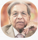
Shri N K Singh

Chairman, 15th Finance Commission of India