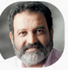
Shri Mohandas Pai

Former Commander-in-Chief, Western Naval Command, Indian Navy