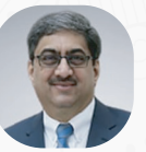
Shri. Gautam Bambawale

Former Secretary, Ministry of External Affairs, India