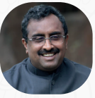
Shri Ram Madhav

Member, Board of Governors, India Foundation; Member, National Executive, RSS