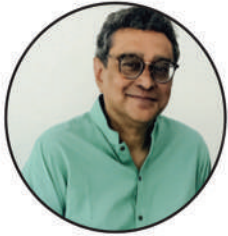
Swapan Dasgupta Member of Parliament, Rajya Sabha