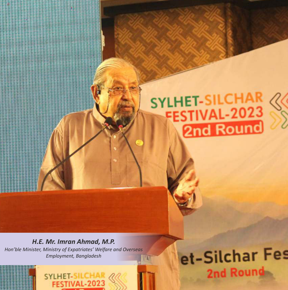
H.E. Mr. Imran Ahmad, M.P.

Hon'ble Minister, Ministry of Expatriates' Welfare and Overseas Employment, Bangladesh