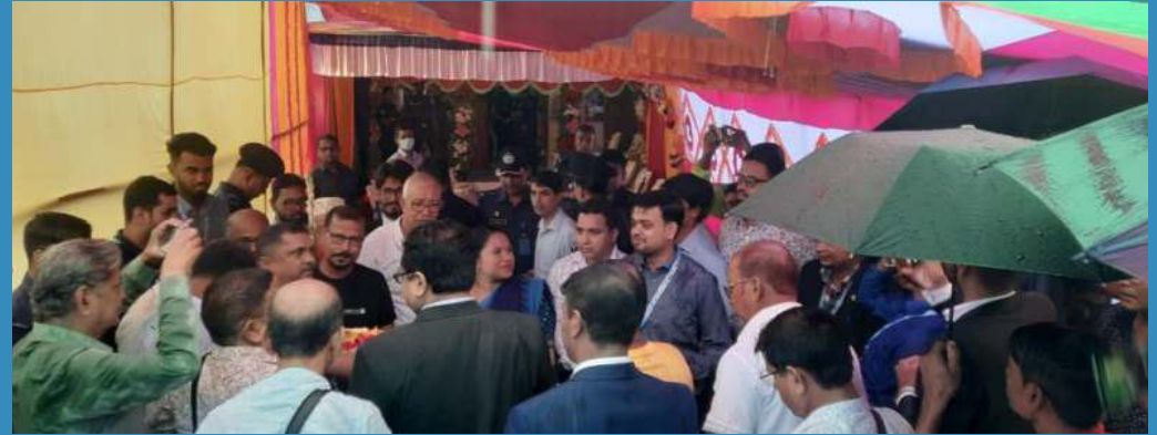
Indian Delegates being received at the Sutarkandi Border, Assam