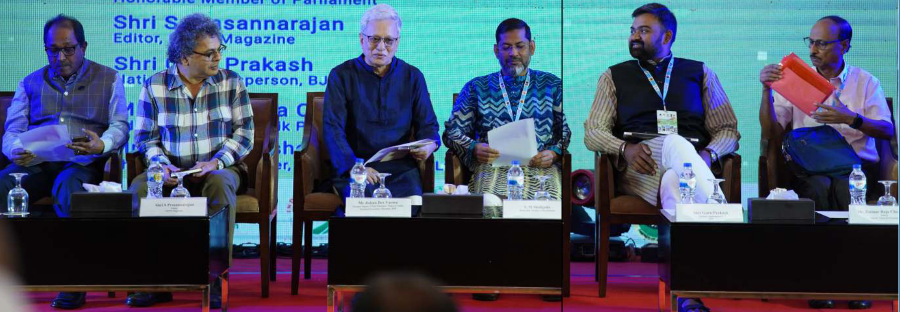
Panel Discussion- II Language & Literature