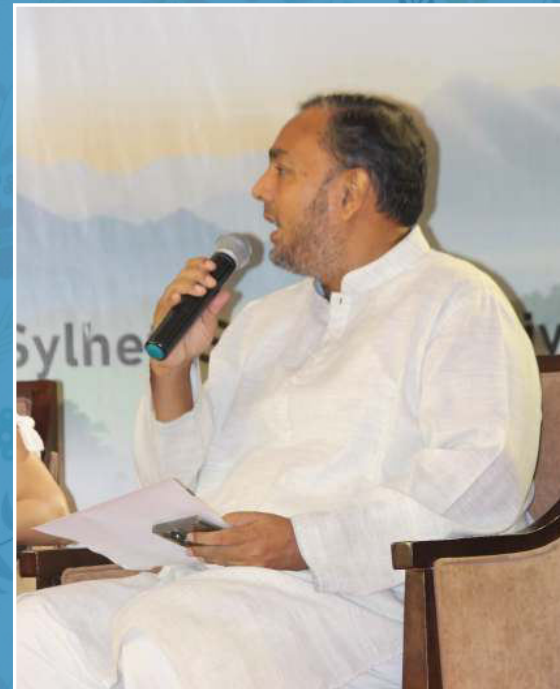
Mr Ahasanul Islam (Titu) Member of Parliament, Bangladesh