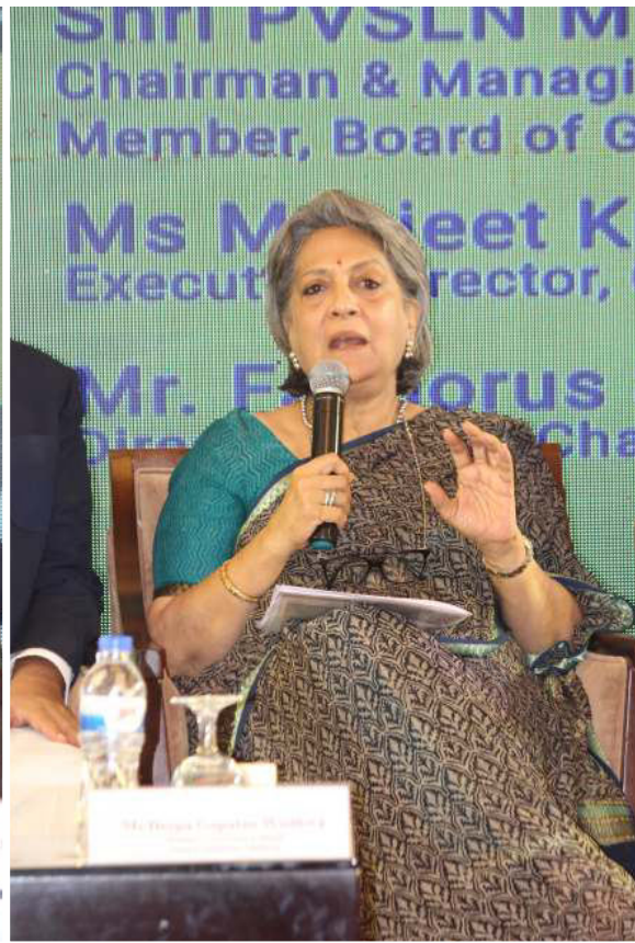
Amb Deepa Gopalan Wadhwa Member, Governing Council, Asian Confluence Shillong, India