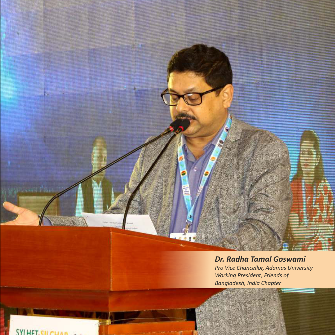
Dr. Radha Tamal Goswami

Member of Parliament, Cultural Affairs Secretary Bangladesh Awami League