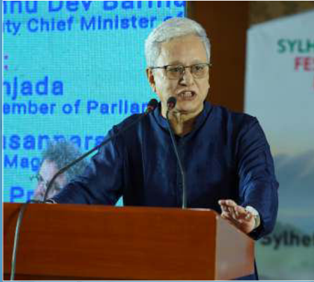
Shri Jishnu Dev Barman Former Deputy Chief Minister of Tripura, India