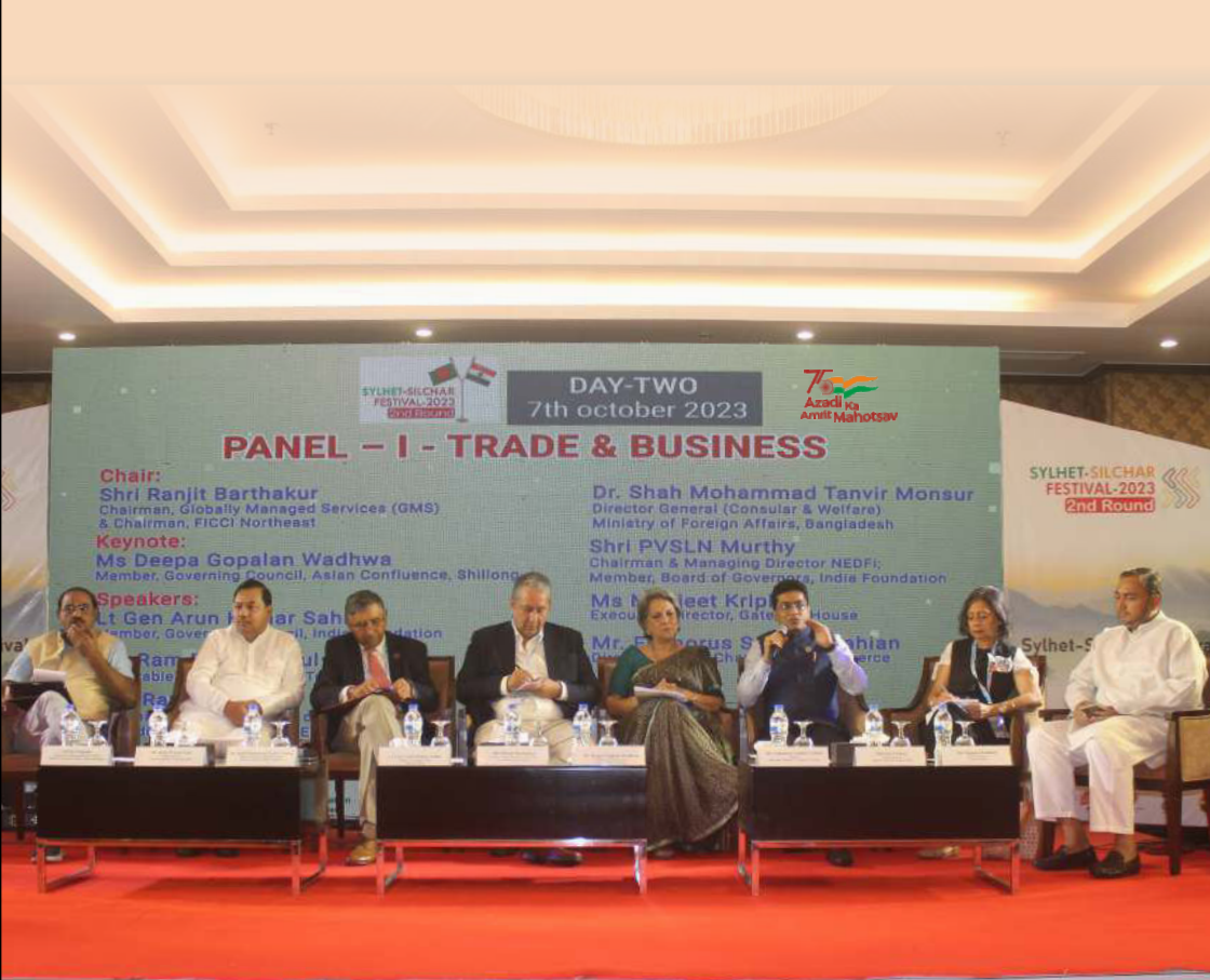
Silchar Festival 2nd Round